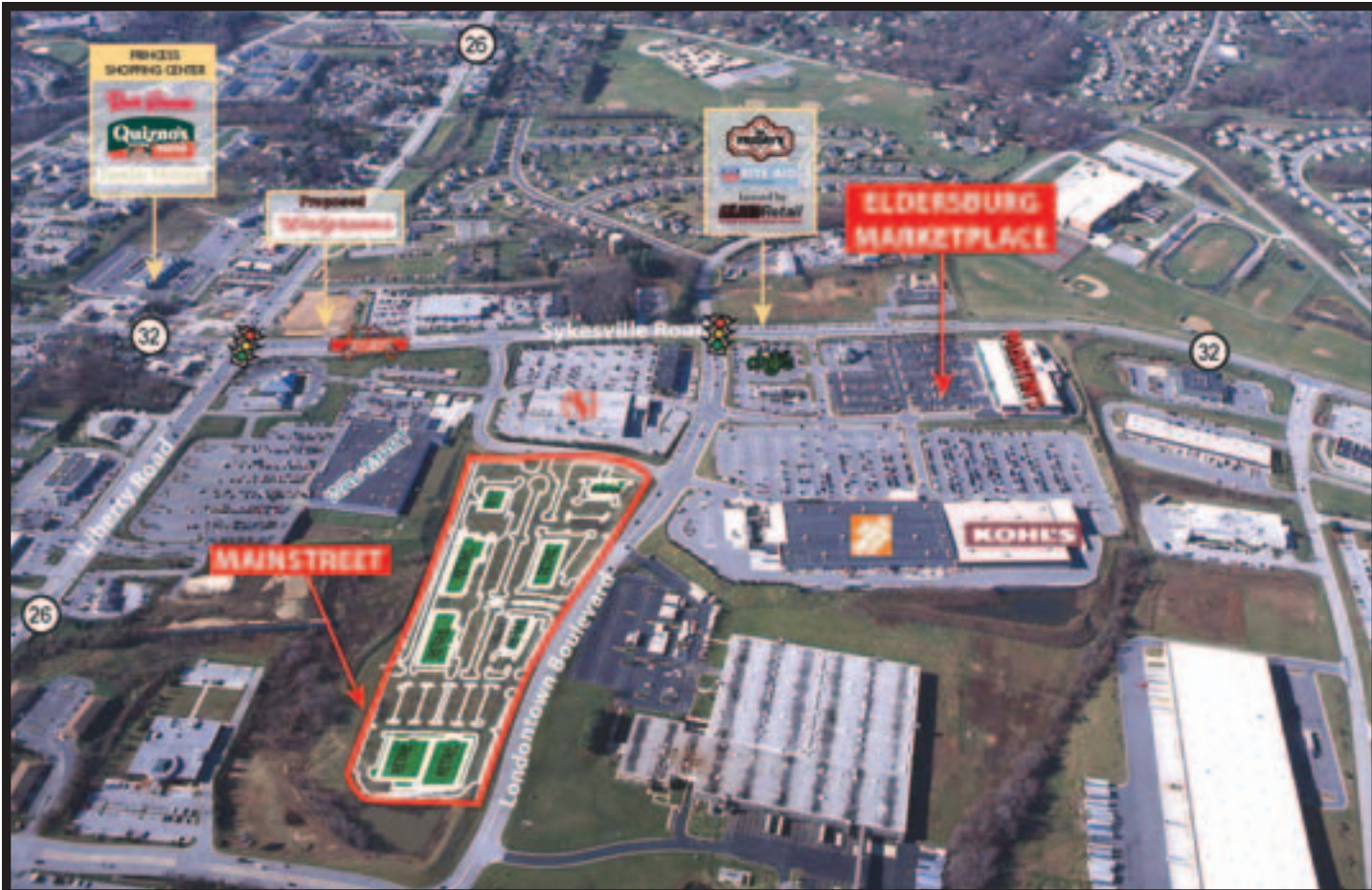
▲ Aerial ▼ Location Map