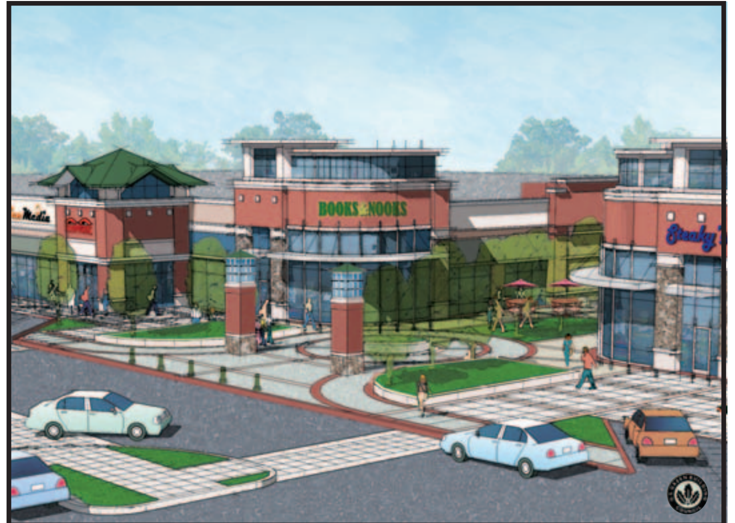
Main Street Eldersburg Eldersburg Main Street Eldersburg, Maryland 83,000 Square Feet