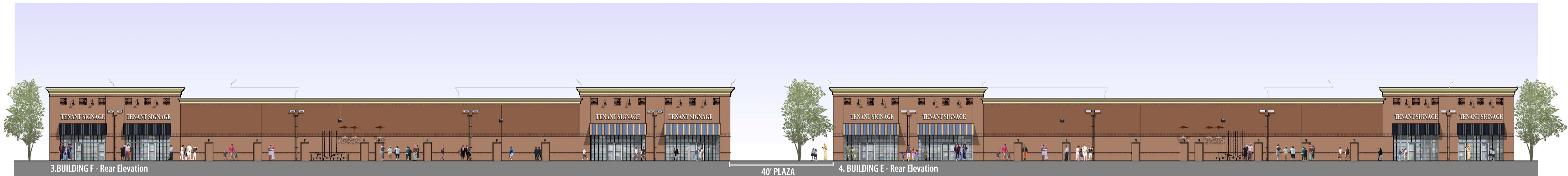
3. BUILDING F - Rear Elevation