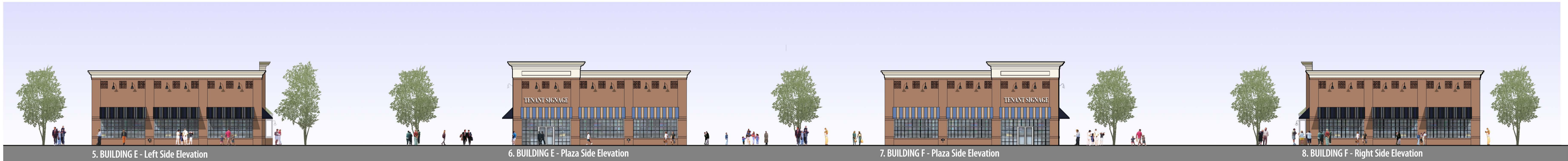
5. BUILDING E - Left Side Elevation