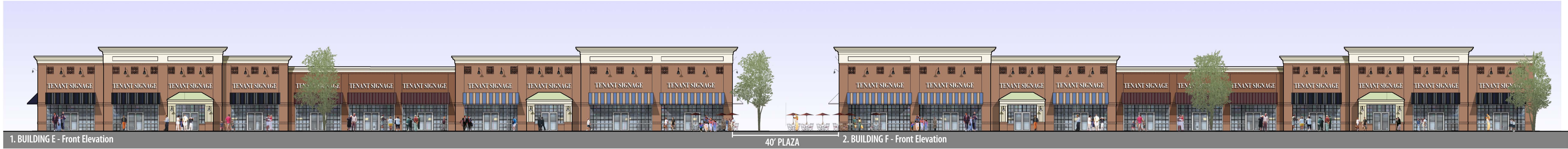
1. BUILDING E - Front Elevation