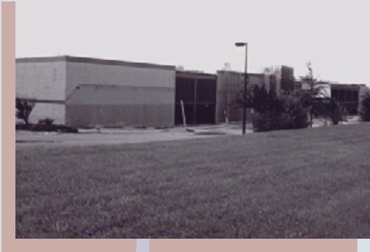
The former Lowe's store is transformed into Westminster Crossing East.