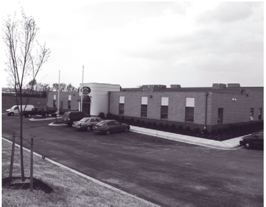
Integral Component's new 20,000-square-foot facility in the West Branch Trade Center in Westminster