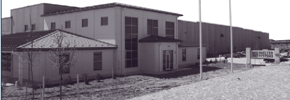
Shelter Systems new plant near Carroll County Regional Airport