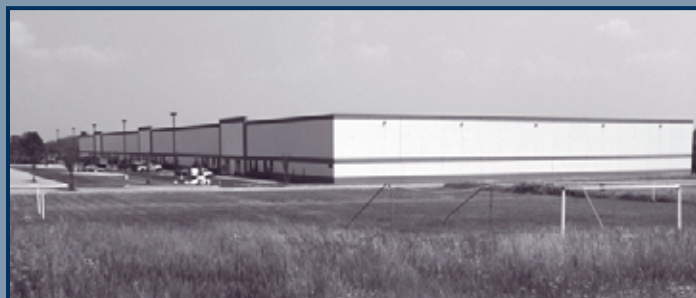
Daltile's new distribution facility on Progress Way in Eldersburg

home to Daltile. Merritt Properties constructed a 200,000-square-foot facility in the Eldersburg Business Park to accommodate the company's expansion. Daltile has operated a distribution center in the county for 10 years and, with the addition of this new space, they represent 500,000 square feet of space in Carroll. The new facility is being used as the company's Northeast Distribution Center.