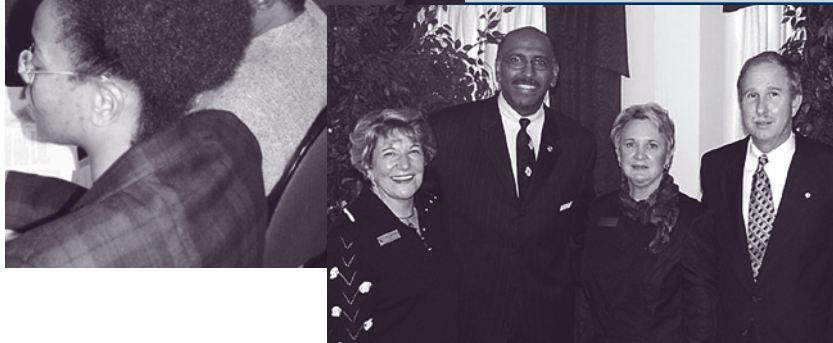
Top: Lt. Gov. Michael S. Steele speaks during the keynote address.

"The business of government is to keep out of the way of business and let business do what business does best ... that is grow, grow, grow."